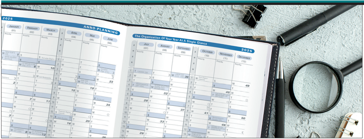
PRENOTE - 8 1/4" x 11 5/8" (21 x 29.7 cm)