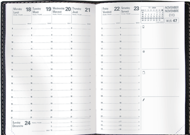
UNIVERSITY - 4" x 6" (10 x 15 CM) Bi-lingual (EN/FR)

Both the Academic Minister and the University include annual planning pages, daily 8am to 9pm schedules, priority boxes, and space for contacts, but the Academic Minister also features monthly planning pages, three monthly calendars on each spread instead of one, and 90g paper instead of 64g.