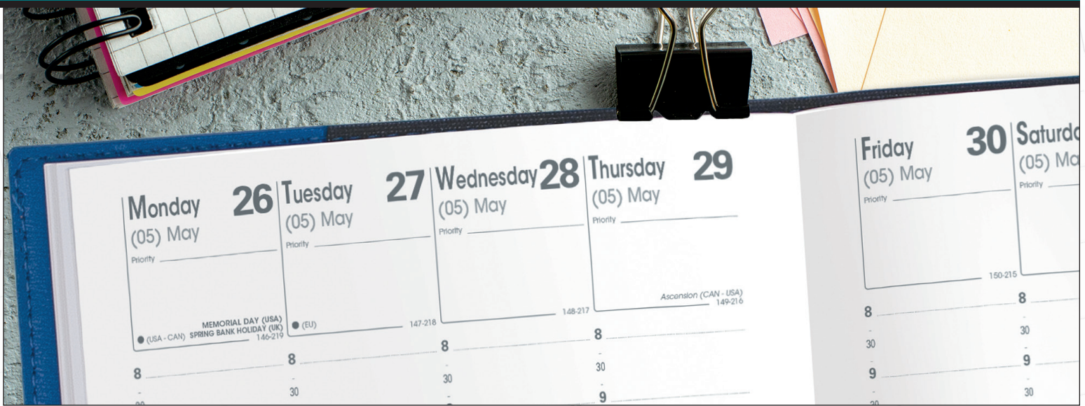
ACADEMIC MINISTER - 6 1/4" x 9 3/8" (16 x 24 CM)